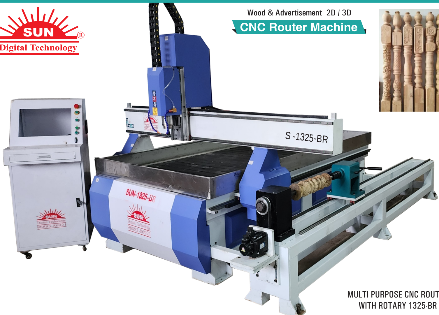
MULTI PURPOSE CNC ROUTER WITH ROTARY 1325-BR

This Machine Working on: Glass, Woods, MDF, ACP Sheet, Acrylic Sheet, Hardwood, PVC, Sheet, Korean Cutting, 2D & 3D Carving. Marble, Granite, Metal, Aluminium, Copper, Brass